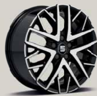
Urban Black R Machined Bt