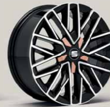
Diamond cut in Mystic Magenta St XE FR