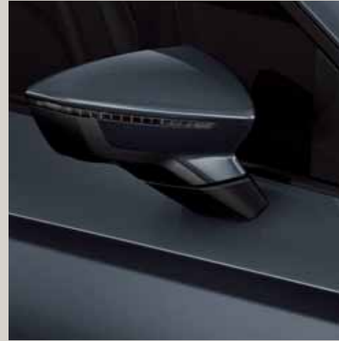
Magnetic Tech 2 R St XE FR Bt