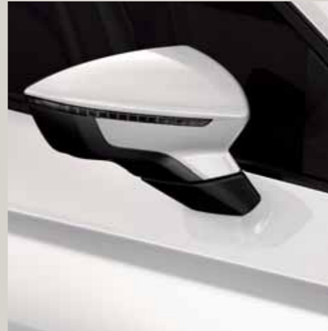
Candy White 1 R St XE FR