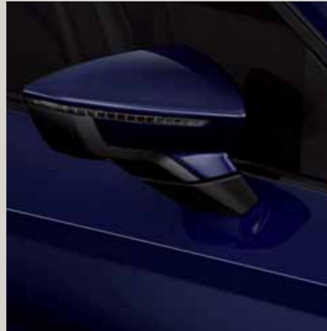
Mediterraneo Blue 1 R St XE FR