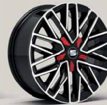
Diamond cut in Desire Red St XE FR