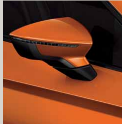
Eclipse Orange 2,3 R St XE FR Bt