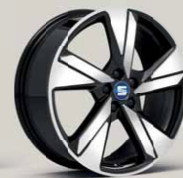
Diamond cut in Mystery Blue St XE FR