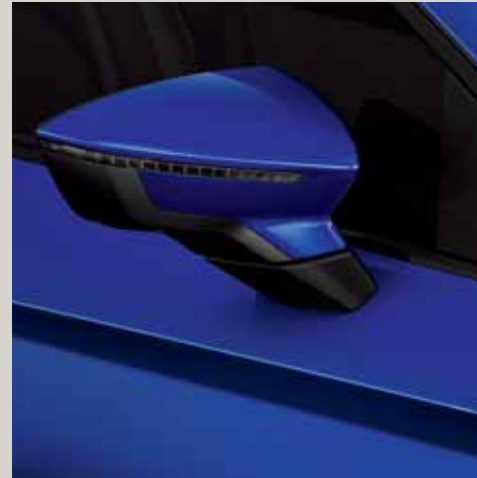
Mystery Blue 2,3 R St XE FR