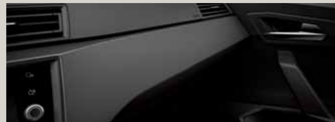
Cloth Black & Grey Comfort seats CB St