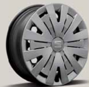
Urban R St