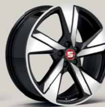
Diamond cut in Desire Red St XE FR