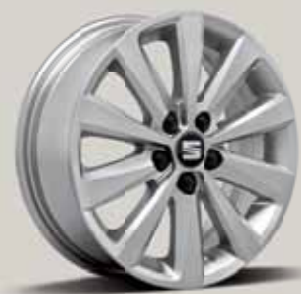
Enjoy R St XE