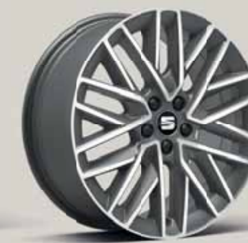
Diamond cut in Cosmo Grey St XE FR