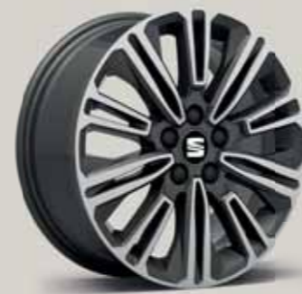
Design Machined XE