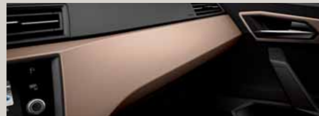
Cloth Edge Mystic Comfort seats DL XE