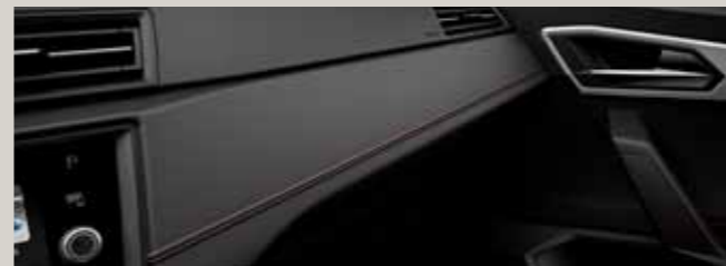
Dinamica® Black Sport seats FL + PL7 FR