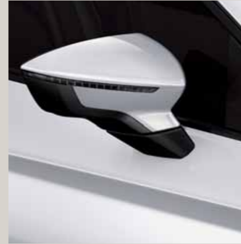
Nevada White 2 R St XE FR Bt