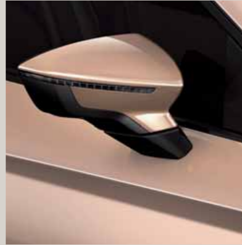
Mystic Magenta 2 R St XE