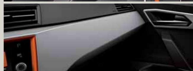
Dinamica® Beats Sport seats 52S Bt