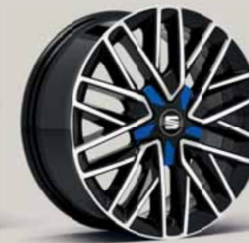
Diamond cut in Mystery Blue St XE FR