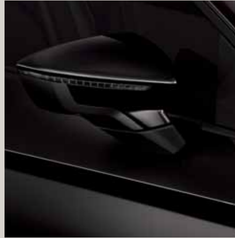
Midnight Black 2 R St XE FR Bt