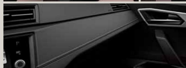
Cloth Edge Mystic Comfort seats DL + PIG + PIG / DL + PIF¹ XE