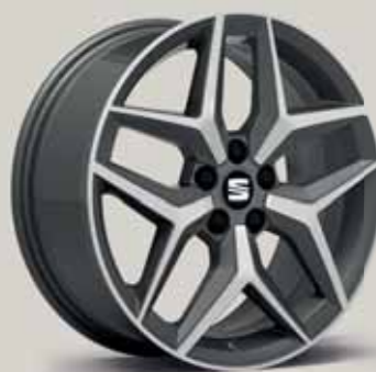
Dynamic Machined XE