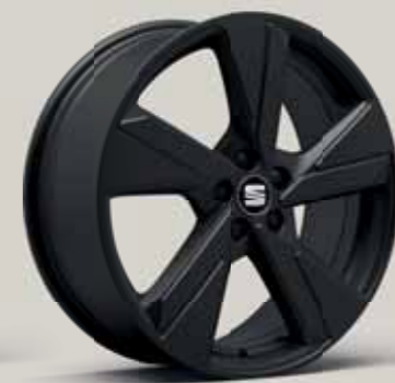
Sport Black FR

Reference R Style St Xcellence XE FR FR Beats Bt Standard ■ Optional ■