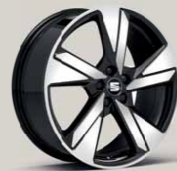
Diamond cut in Piano Black St XE FR