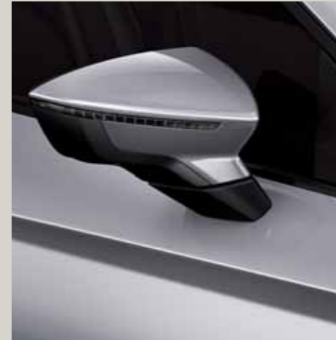
Urban Silver 2 R St XE FR Bt

Reference R Style St Xcellence XE FR FR Beats Bt Optional ■