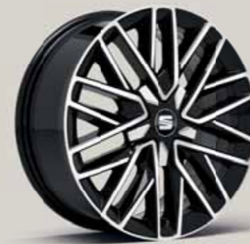
Diamond cut in Silver St XE FR