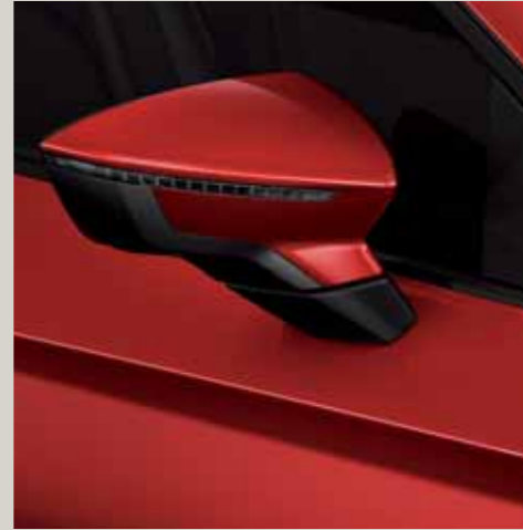
Desire Red 2,3 R St XE FR