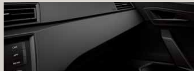
Cloth Black Comfort seats AF R