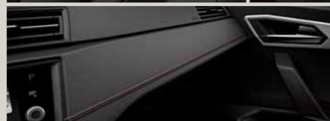
Cloth Black Sport seats FL FR