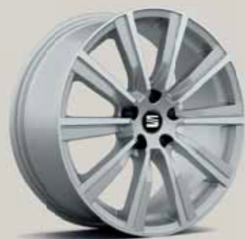
CupRacer Grey R St FR