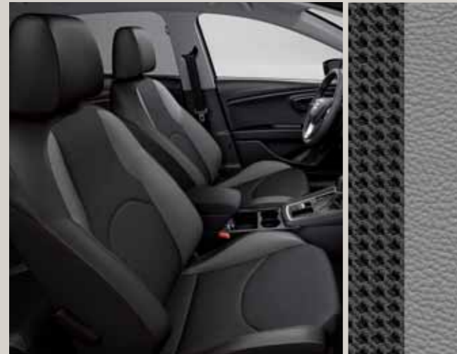
Cloth Germe Sport seats AD