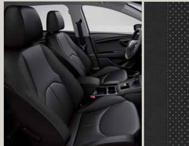
Leather Black Sport seats CE + WL1