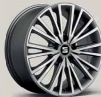
Dynamic 30/4 Atom Grey St