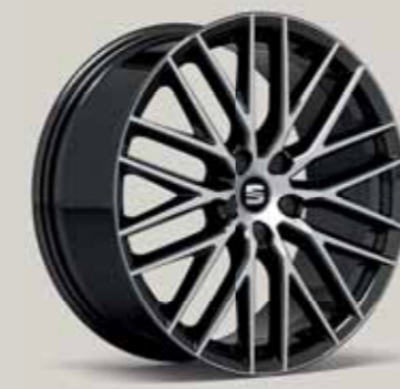
Black Performance FR CU

Reference R Style St Xcellence XE FR FR X-PERIENCE XP CUPRA CU Standard ■ Optional ■