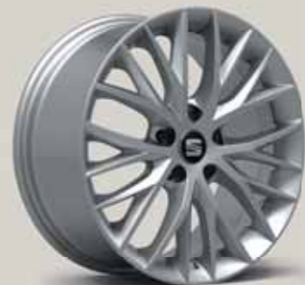
Dynamic 30/3 St