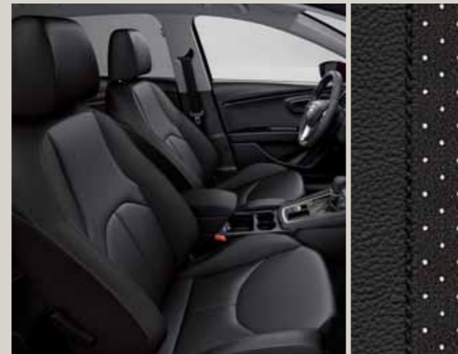
Leather Black Sport seats DE + WL1