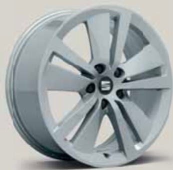
Dynamic Grey R St FR