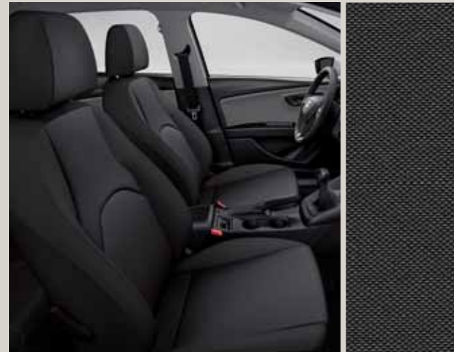
Cloth Coffeeblack Comfort seats AE