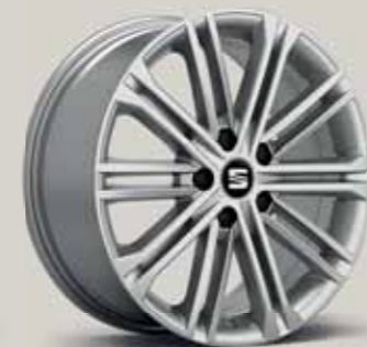
Dynamic 30/1 XE