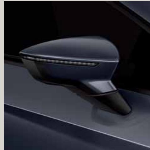
Magnetic Tech 2 R St XE FR XP CU