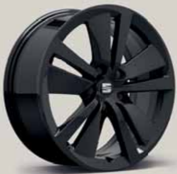
Black R St FR