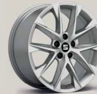
Performance 30/1 FR