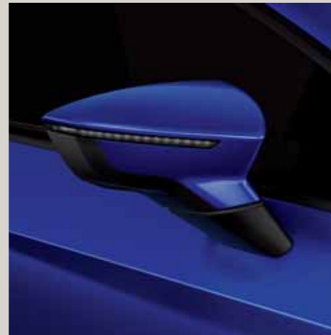
Mystery Blue 2 R St XE FR CU