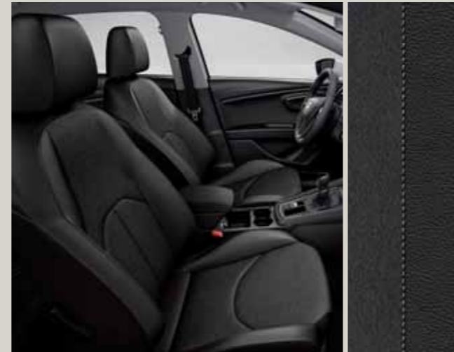
Alcantara® Black Sport seats CE + WL3'