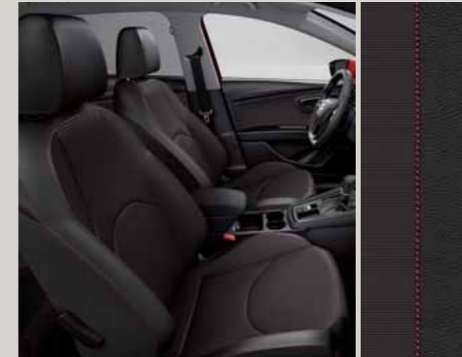
Cloth Techny Black Sport seats GE