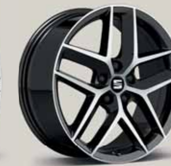
Performance 30/2 Machined FR