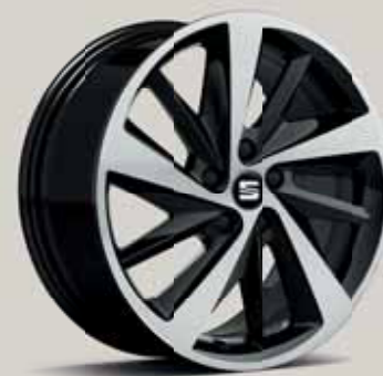
Black Machined R St FR