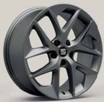
Titanium Grey R St FR