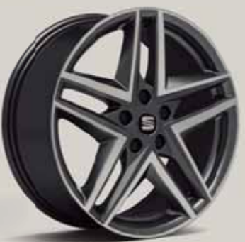
Sport Black R St FR