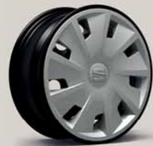
Urban 30/1 R