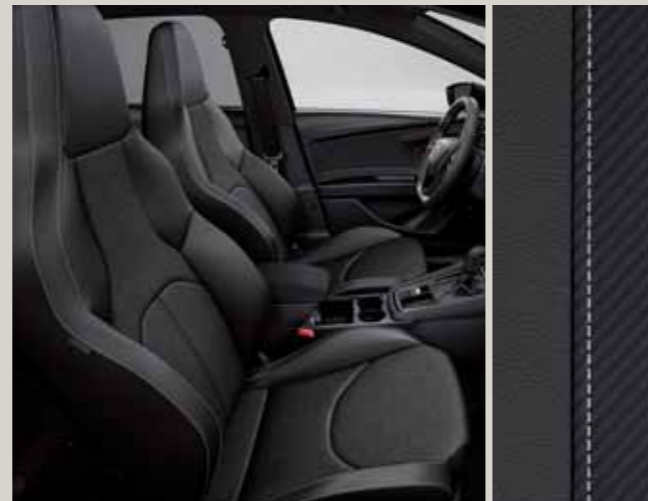
Bucket seats LE+PL6