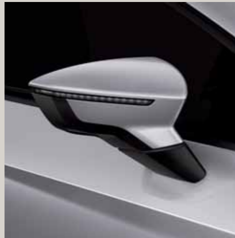
Urban Silver 2 R St XE FR XP CU