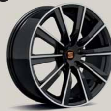
Machined Black CU