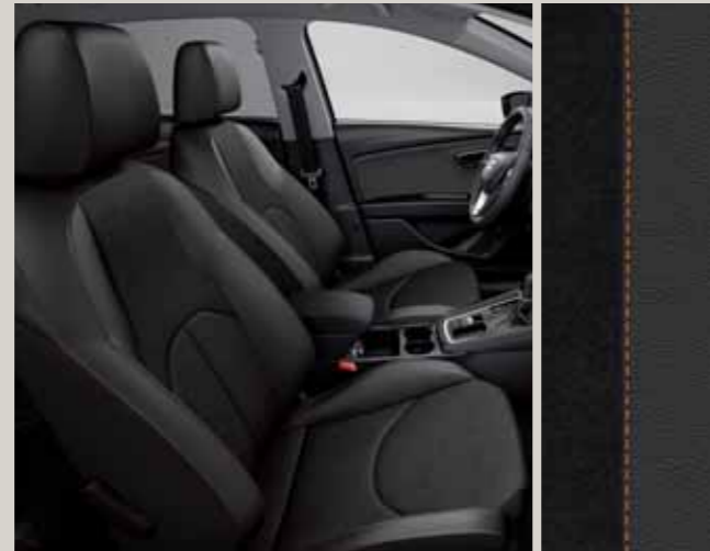
Alcantara® Black Sport seats AD + WL3 1