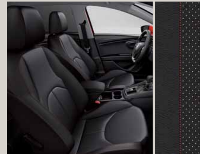
Leather Black Sport seats GE + WL1