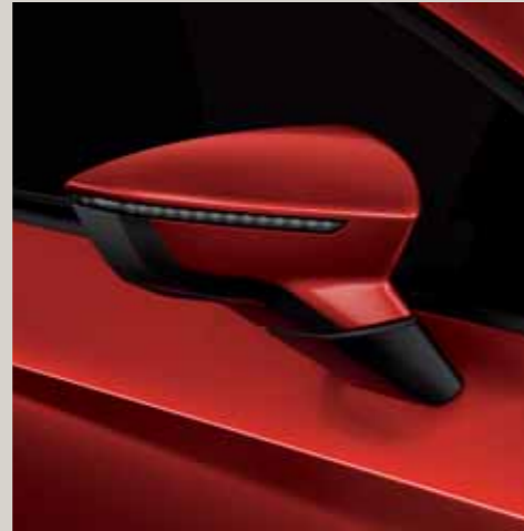
Desire Red 2 R St XE FR CU