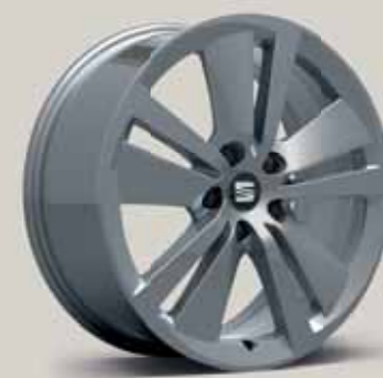
Anthracite R St FR