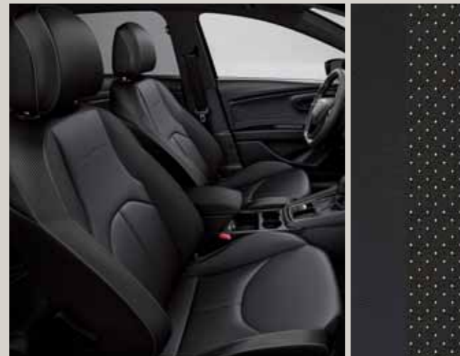
Leather Black Sport seats LE + WL1