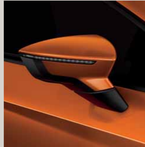
Eclipse Orange 2 R St XE FR XP