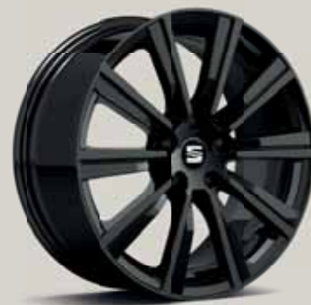
CupRacer Black R St FR