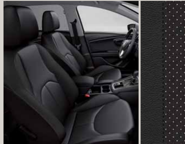
Leather Black Sport seats AD + WL1