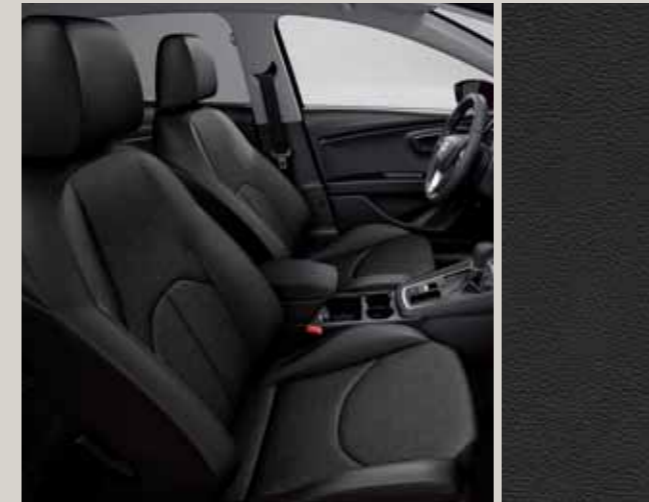
Alcantara® Black Sport seats DE + WL3'