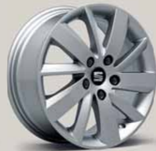
Design 30/1 R