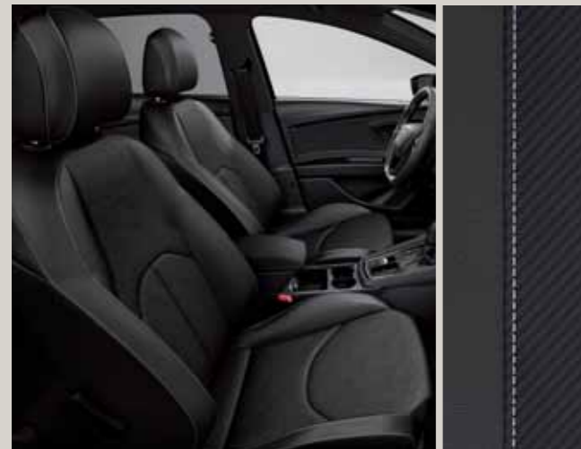
Alcantara® Black Sport seats LE 1