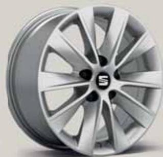
Design 30/2 St