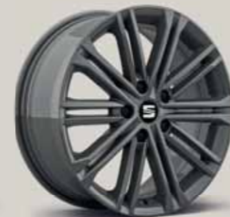
Dynamic 30/1 XE