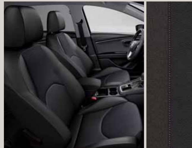
Cloth Teddy/Mikelly Sport seats DE