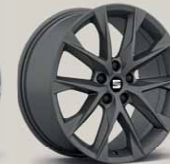
Performance Machined Atom Grey XP