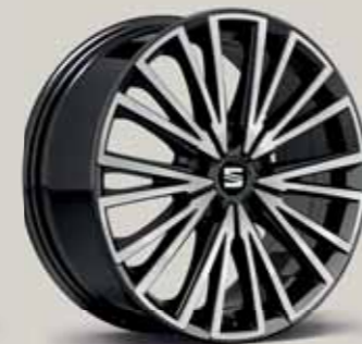
Dynamic 30/4 Black High Gloss XE