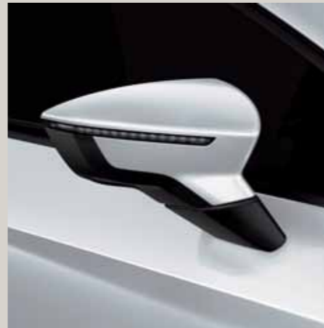
Nevada White 2 R St XE FR XP CU