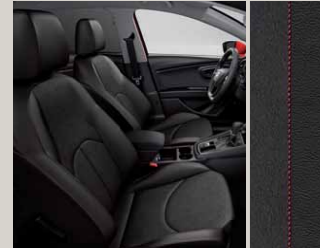
Alcantara® Black Sport seats GE + WL3'