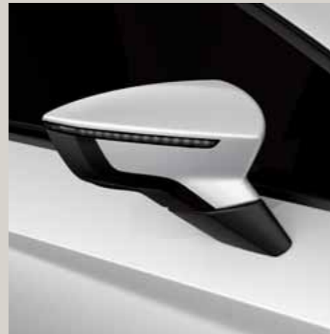
White 1 R St XE FR XP