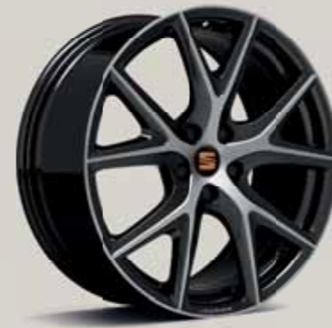
Machined Silver CU