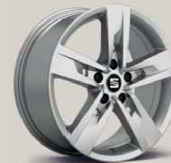
Dynamic 30/2 FR