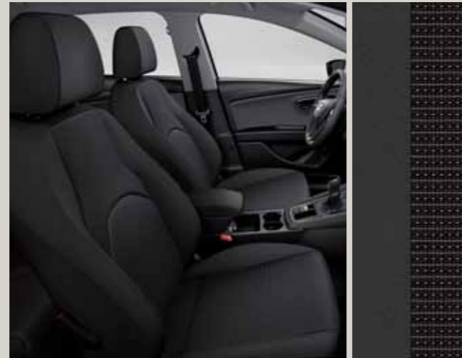
Cloth Tresil Comfort seats CE