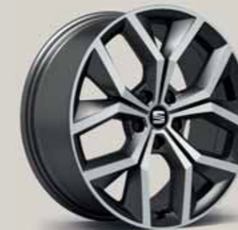
Performance Machined Atom Grey XP