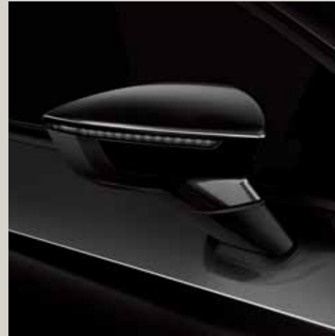
Midnight Black 2 R St XE FR XP CU