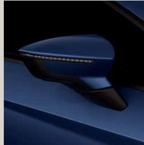
Mediterraneo Blue 1 R St XE FR XP CU