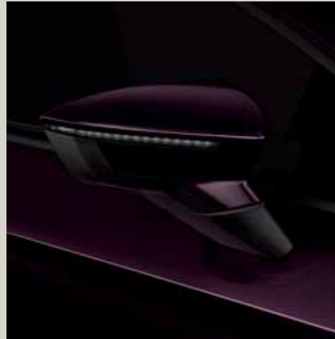
Boheme Purple 2 R St XE FR