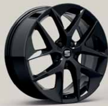
Black R St FR