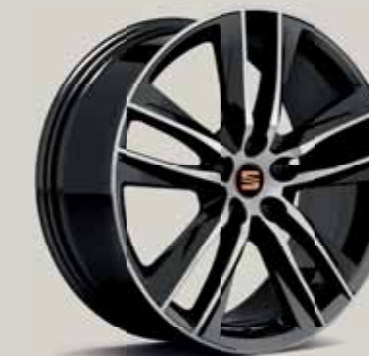
CUPRA 30/2 Black High Gloss CU

Reference R Style St Xcellence XE FR FR X-PERIENCE XP CUPRA CU Standard ■ Optional ■