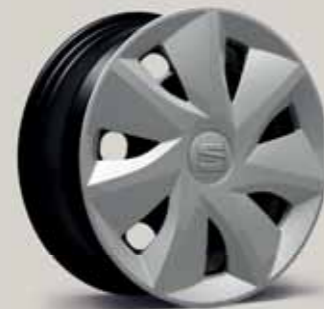
Urban 30/1 R