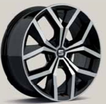
Black X-PERIENCE XP